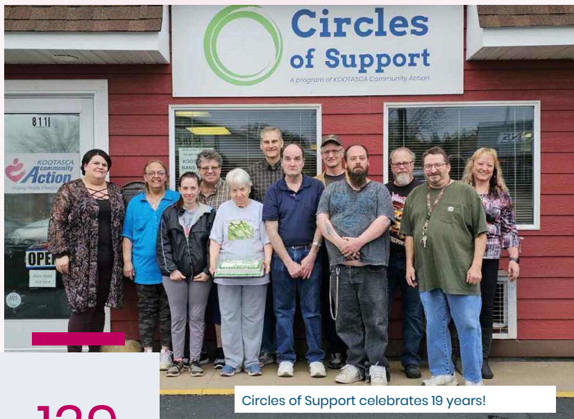
Circles of Support celebrates 19 years!

Circles of Support has taught me how to speak up for myself and related to people better. When I first started going there, I was really quiet. They helped me feel confident and open up. The group helps me stay in contact with other people. It is amazing how talking to someone can get you in a whole new state of mind, just by being there. I've learned how to be a better listener, how to let others know that I appreciate them and how to stand up for what I believe to be right. If a person has a problem and feel like they don't have anyone to depend on, they can find people there who will hear them and be there for them.