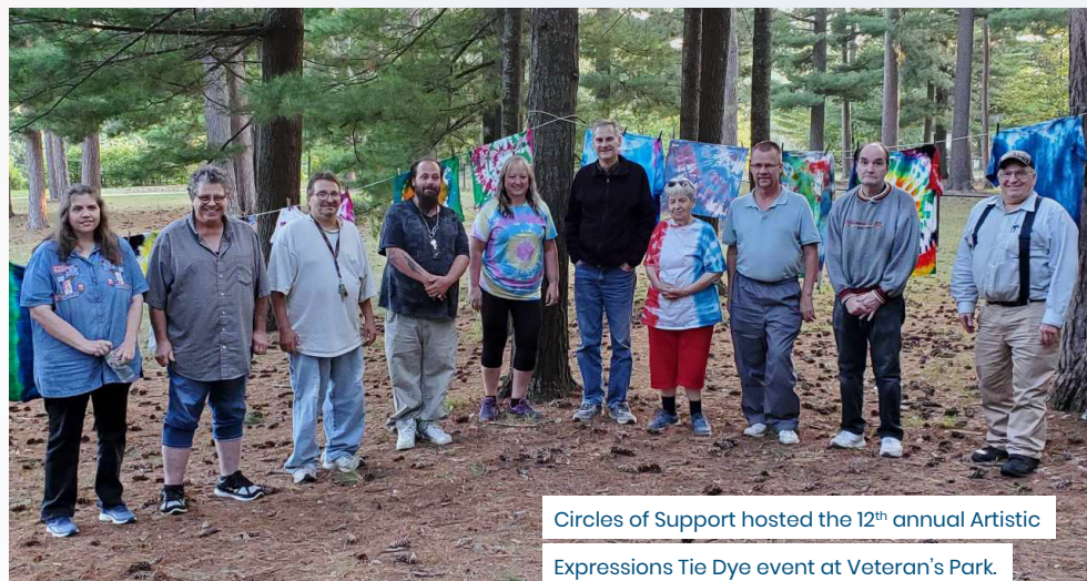
Circles of Support hosted the 12 th annual Artistic Expressions Tie Dye event at Veteran's Park.